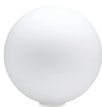
Table lamp with diffuser in satin-finish white blown glass. Supporting structure made of metal or polyester reinforced with glass fibre, painted white.