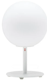
Table lamp with diffuser in satin-finish white blown glass. Supporting structure made of metal or polyester reinforced with glass fibre, painted white.